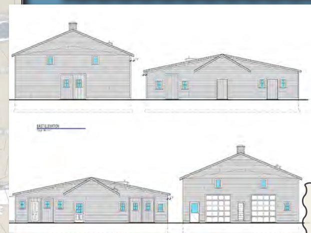
Renderings of the front and back of the historic Jensen sheds. The sheds will house exhibits on commercial fishing and the MMM's collection of antique outboard motors and small craft.

While the Museum project is underway, the existing docks will not be suitable for boats. The Museum plans to completely revitalize the waterfront. Elsie J., the Jensen's historic fish tug they run as a charter boat, will remain under the ownership of the Jensens and continue to operate from the Museum docks in the future.